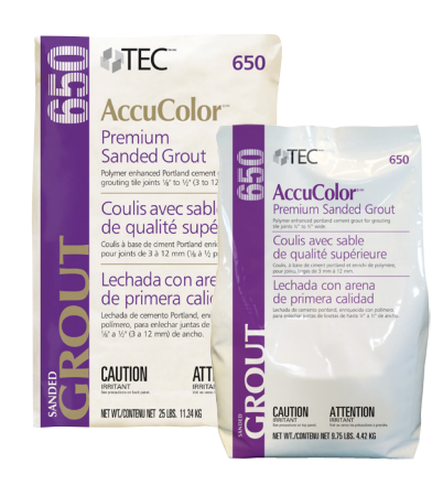
Product contains zero VOC.