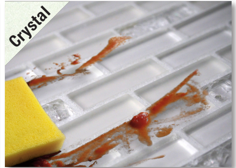
Stain-proof* with no sealing