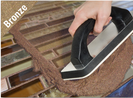
Ready-to-use, spreads easily