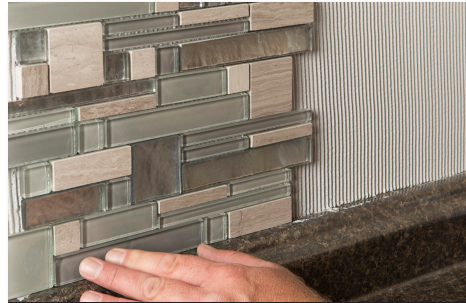
Best for bonding most glass and porcelain tiles