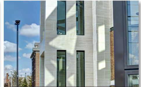
Interior/exterior use Exceeds ANSI A118.4E, A118.11 and A118.15E specifications