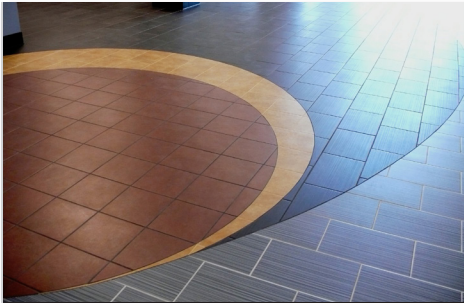
Unparalleled bond strength of 700 psi for porcelain tile over plywood, cementitious surfaces and other substrates