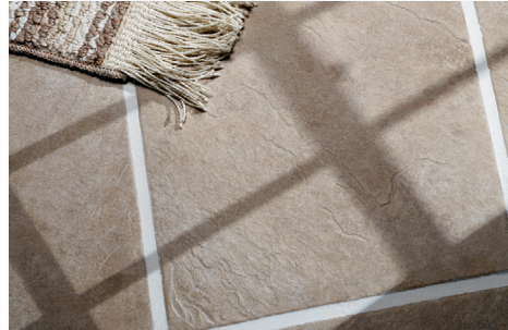
Superior UV stability