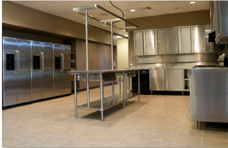
Excellent stain and chemical resistance

A dual-purpose mortar/grout, three-part epoxy system for interior (both interior/exterior when used as grout) floors, walls and countertops is designed for residential to extra heavy commercial use. Used as a grout, this system is recommended wherever complete stain or chemical resistance is required and/or desired. High temperature (HT) formula is approved for surfaces subject to extreme heat or steam cleaning up to 350°F (177°C). Used as a mortar, this system is ideal for installing green marble and other moisture-sensitive stones and agglomerates over a wide variety of substrates, including cold rolled steel. For details about TEC® product or system warranties, contact your sales associate or visit tecspecialty.com .