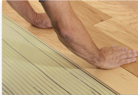
Outstanding initial grab