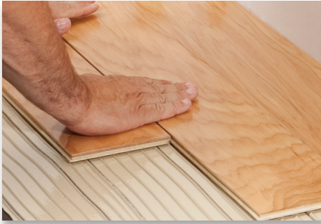
Fast initial grab with strong bond strength

TEC® WoodPerfect™ Advanced Performance Wood Flooring Adhesive is a ground-breaking development in wood flooring adhesives that maximizes performance with installer-friendly benefits. Unlike other premium offerings, WoodPerfect™ delivers one-step moisture control, strong initial grab, sound deadening and crack bridging capabilities in an installer-friendly formula that's easy to apply and easy to clean.