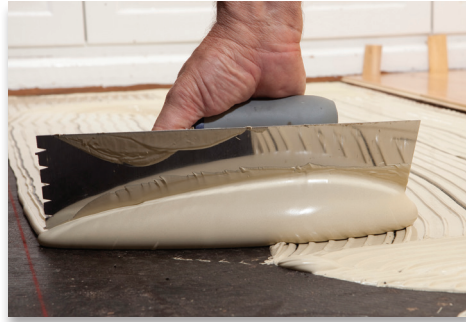
Smooth, low odor, installer-friendly formula