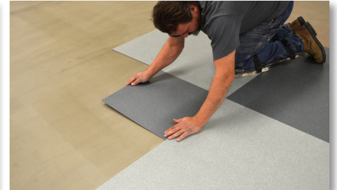
Fast drying formula allows for same-day installation