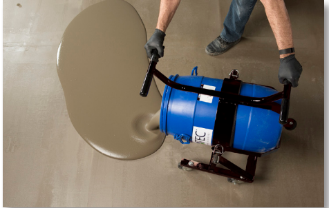
Pourable or pumpable for interior applications