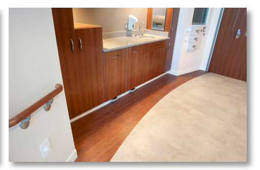
Install moisture sensitive floor covering in 16-24 hours